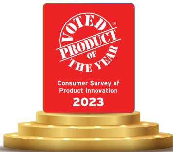
Winner Life Insurance - Whole Life Plan Category. Survey of 2001 people by NielsenIQ across categories.