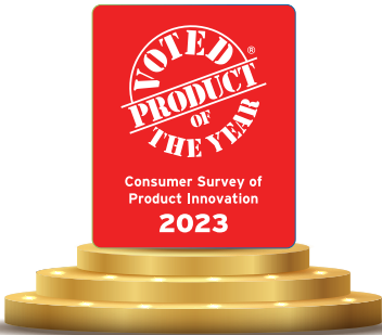
Winner Life Insurance - Whole Life Plan Category. Survey of 2001 people by NielsenIQ across categories.

An Individual, Non-linked, Participating, Savings, Life Insurance Plan UIN: 117N129V01